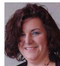
Tory LLP Fellowship Award