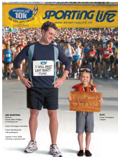
AT THE END OF THE RACE, CAMP OOOH WINS.