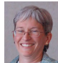
Balfour Award, David Boakes Award, Jo-Ann P. Vickers Award and Honours Certificates