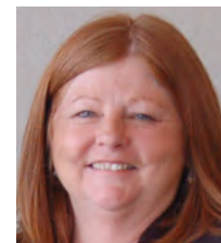
David Boakes Award