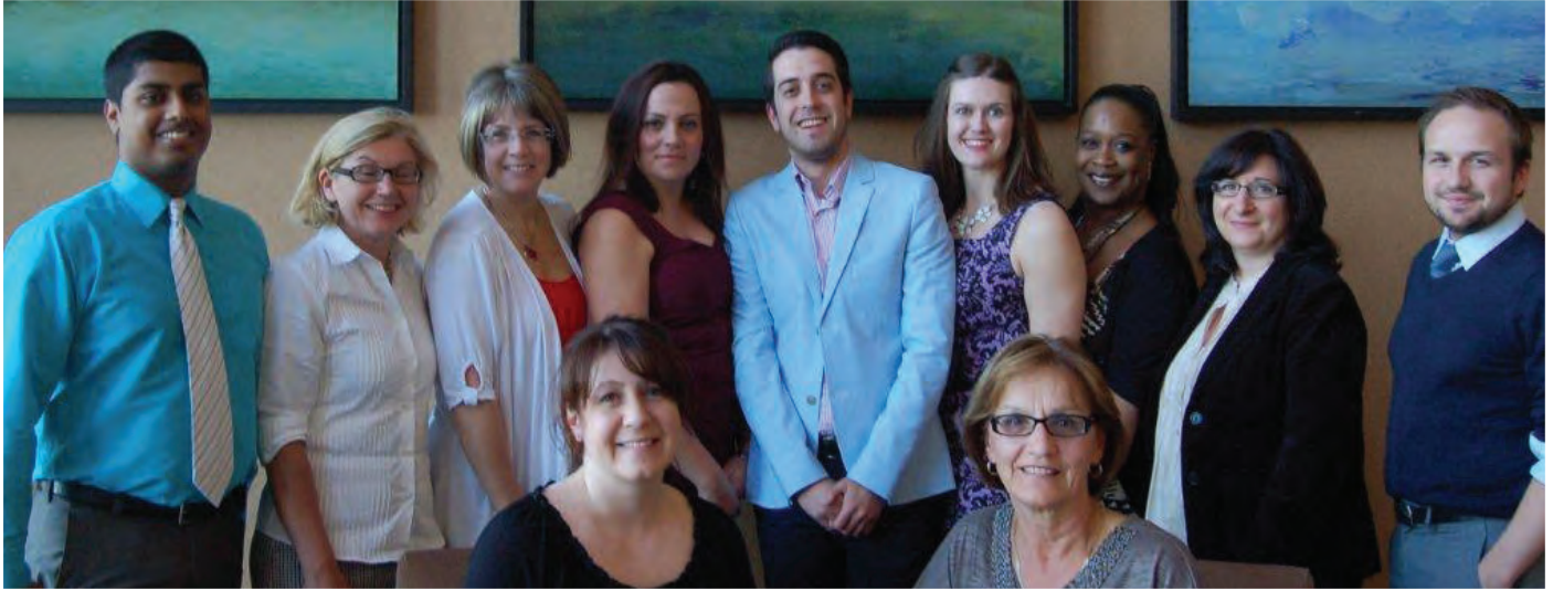
2013 Conference Committee