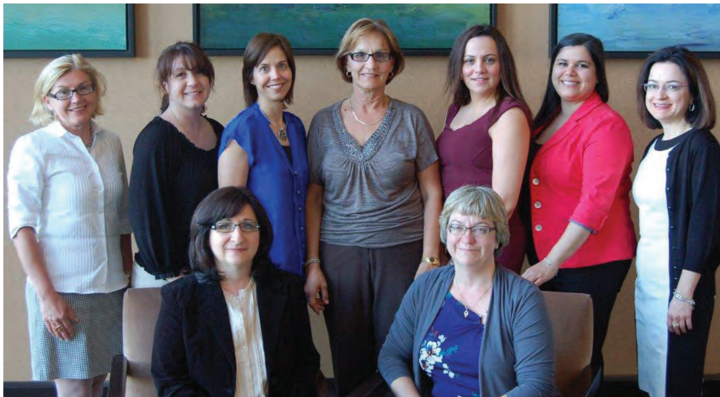
Board of Directors 2013 - 2014