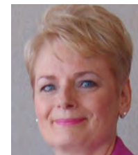
David Boakes Award