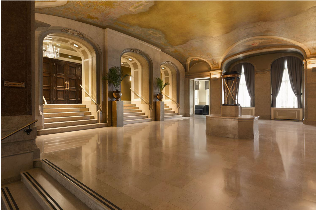
Interior View –Verchères