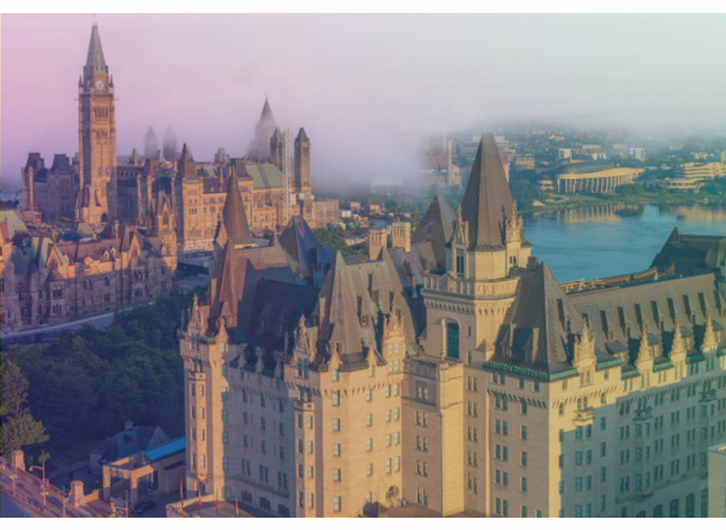
NOVEMBER 1 - 3, 2023 | FAIRMONT CHATEAU LAURIER | OTTAWA